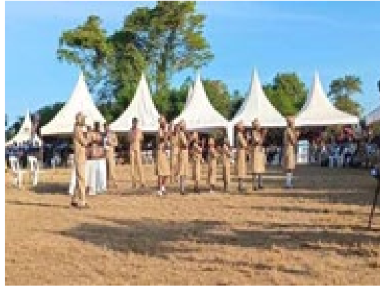
Scouting at Kaazi camp