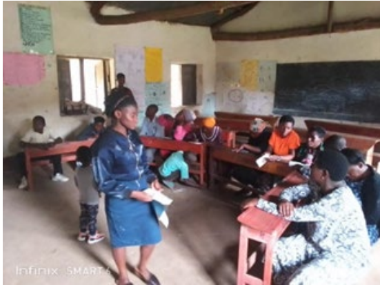
In the classroom