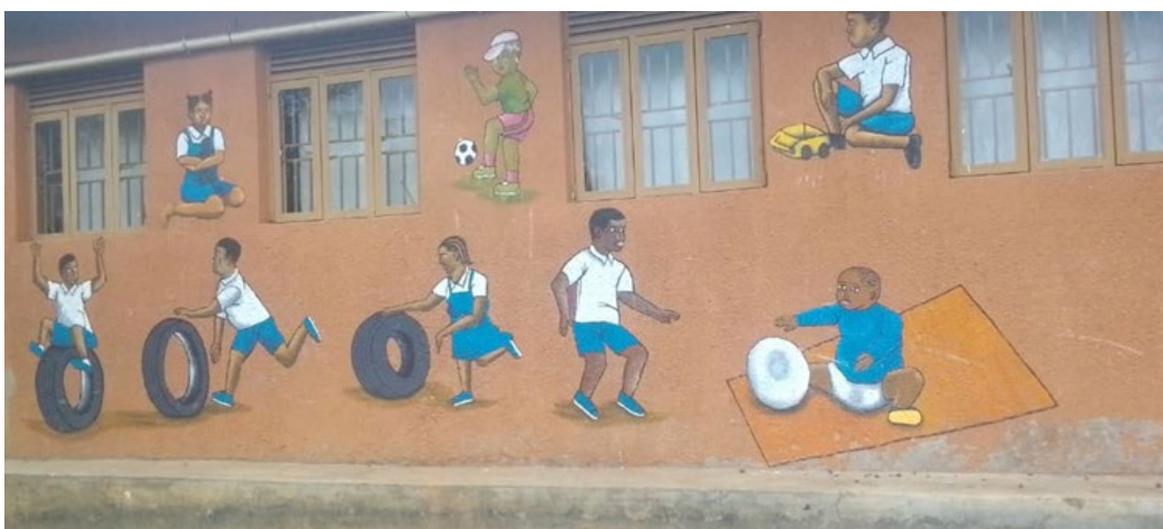
New school mural